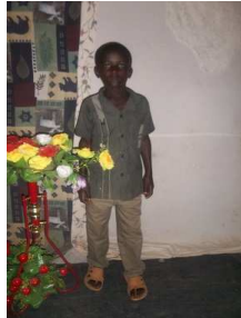
2015 photo and school grades. Grades out of 500