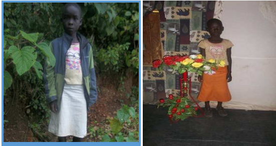
2015 Photo and school grades. Grades out off 500.